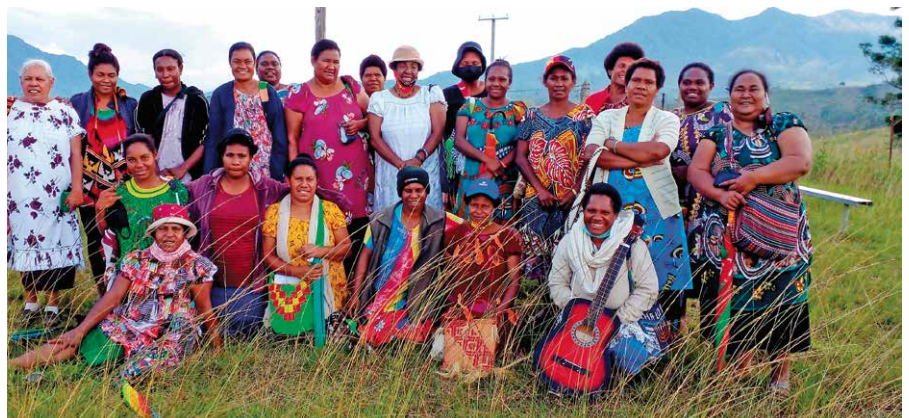
Graduating women gather on Vision Hill as part of their retreat.

Please pray for these students as they leave the College and return to their churches and home places. In some cases, the churches have a ministry assignment for them. Others will be seeking God's direction for their lives. Pray that they would faithfully serve God with the knowledge and skills they have acquired at CLTC.