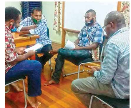
Graduating students in discussion together as part of their retreat.