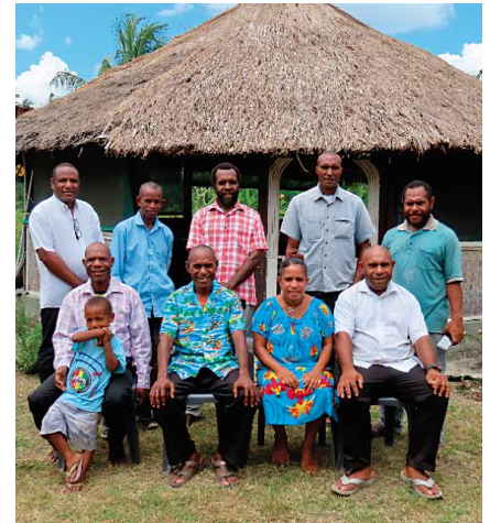
Lae students during the graduating students' retreat.