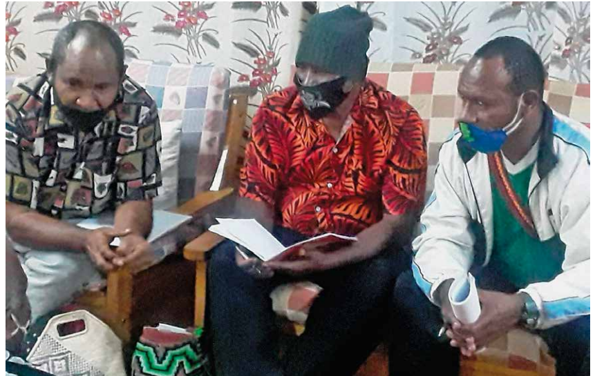
Wearing masks on campus is required but they are not always worn properly.