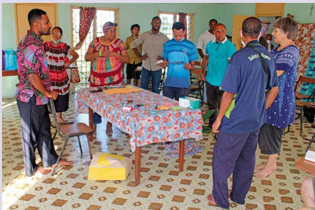
Staff from the CLTC Port Moresby campus meeting with leaders of the Young Missionary Alliance.