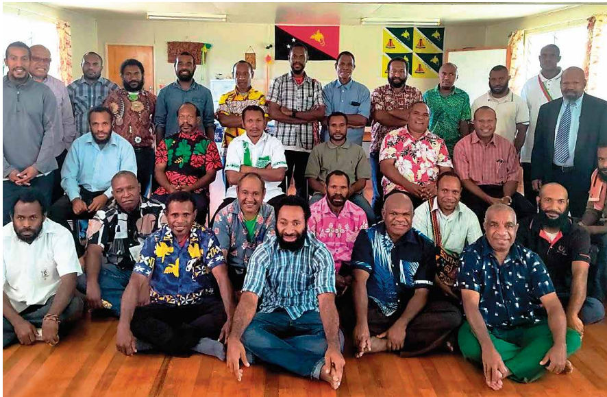
Men at Banz campus ready to graduate this year.