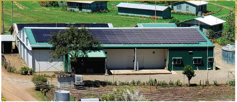
The CLTC hatchery is currently not operating.

Steps are being taken to restructure the College for long term viability. These include: