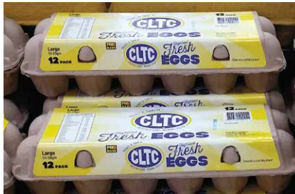
CLTC has raised 3,000 new birds which are now producing table eggs for sale.