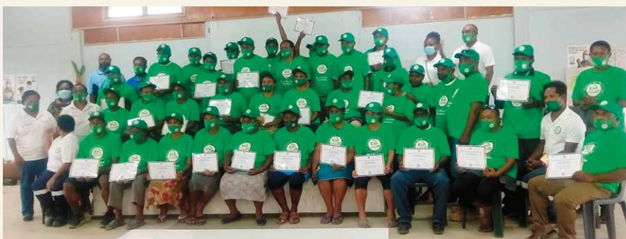
Health workers in Gulf Province who received instruction on the biblical perspective on vaccinations as well as medicine generally.